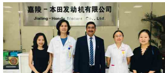
In Chongqing, China with Honda Motor Co., Ltd.

He has been conferred with Hon'ble Doctorate Degree in Shipping & Logistics from "World Peace Institute of United Nations" which is approved by Government of India. This achievement has added another feather in his crown.