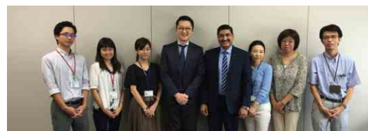
Sumitomo Corp. Japan Team